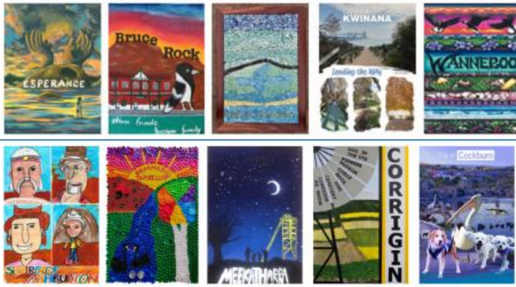
Images: #showCase in Pixels 2019 and 2021 State Winners for each categories