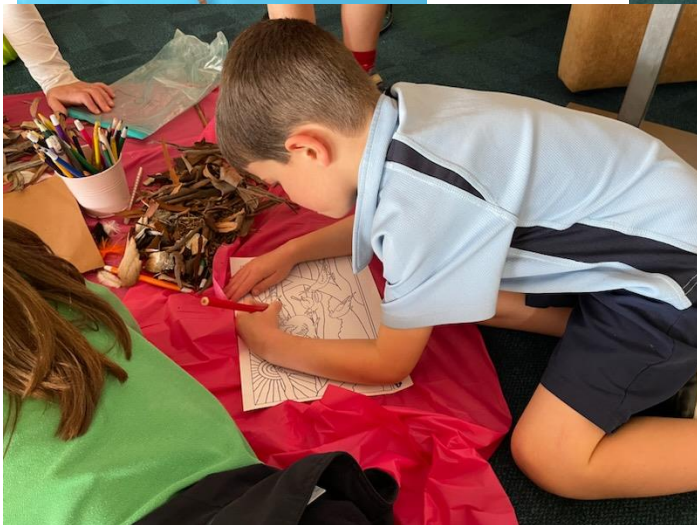
Juniors at the Civic Centre socialising and learning with the mallee schools