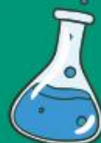
Nard the Nerd